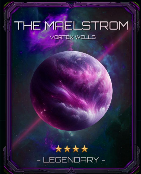
Planet NFT card example